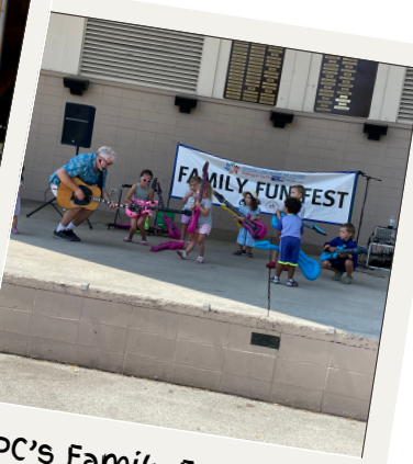
CPC's Family Fun Fest