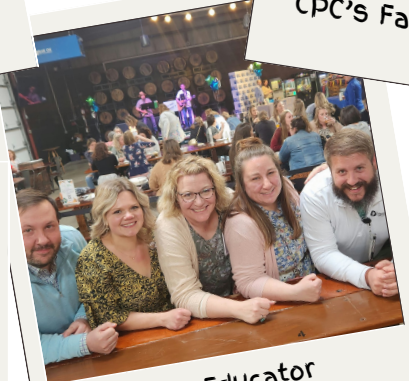
PATH Educator Appreciation Social