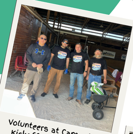
Volunteers at Campaign Kickoff/Day of Caring