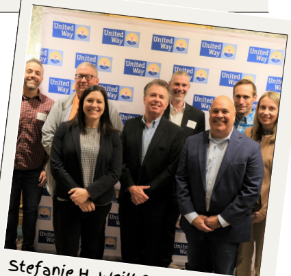
Stefanie H. Weill Center for the Performing Arts Board celebrated at Spirit Awards