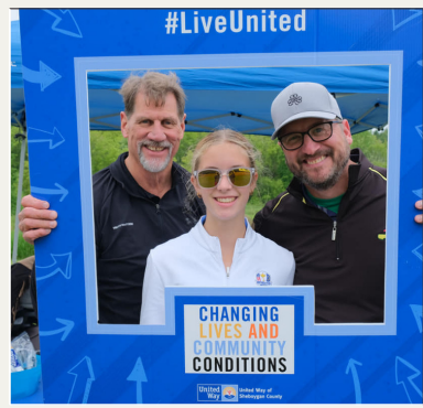
PLENCO team at PATH Mental Health Golf Day