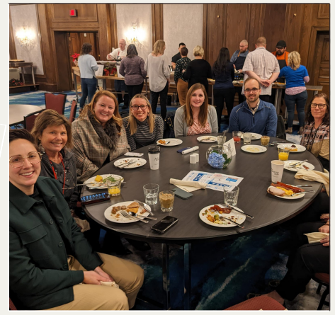
Kohler team at Harvest for the Hungry

Thank you to our nonprofit partners, businesses, donors, volunteers, and supporters that help us improve lives and community conditions!