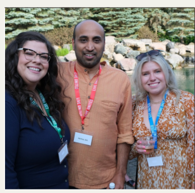
Emerging Leaders at Campaign Celebration