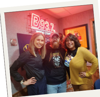
On air with B93.7