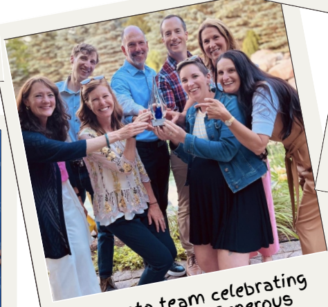
Sargento team celebrating #1 Top Most Generous Workplace